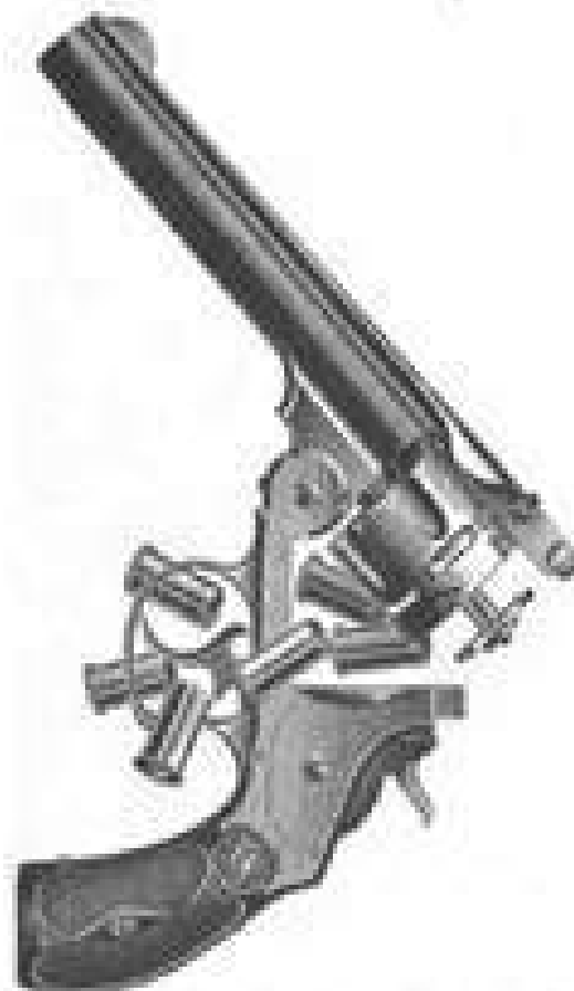
Fig. 11. — Smith & Wesson Navy Revolver, adapted for various .44 caliber cartridges.

New Model Navy, No. 3; double-action; central-fire; caliber .44; six shot; weight, 2 \frac{1}{2} pounds; length of barrel, four, five, and six inches.