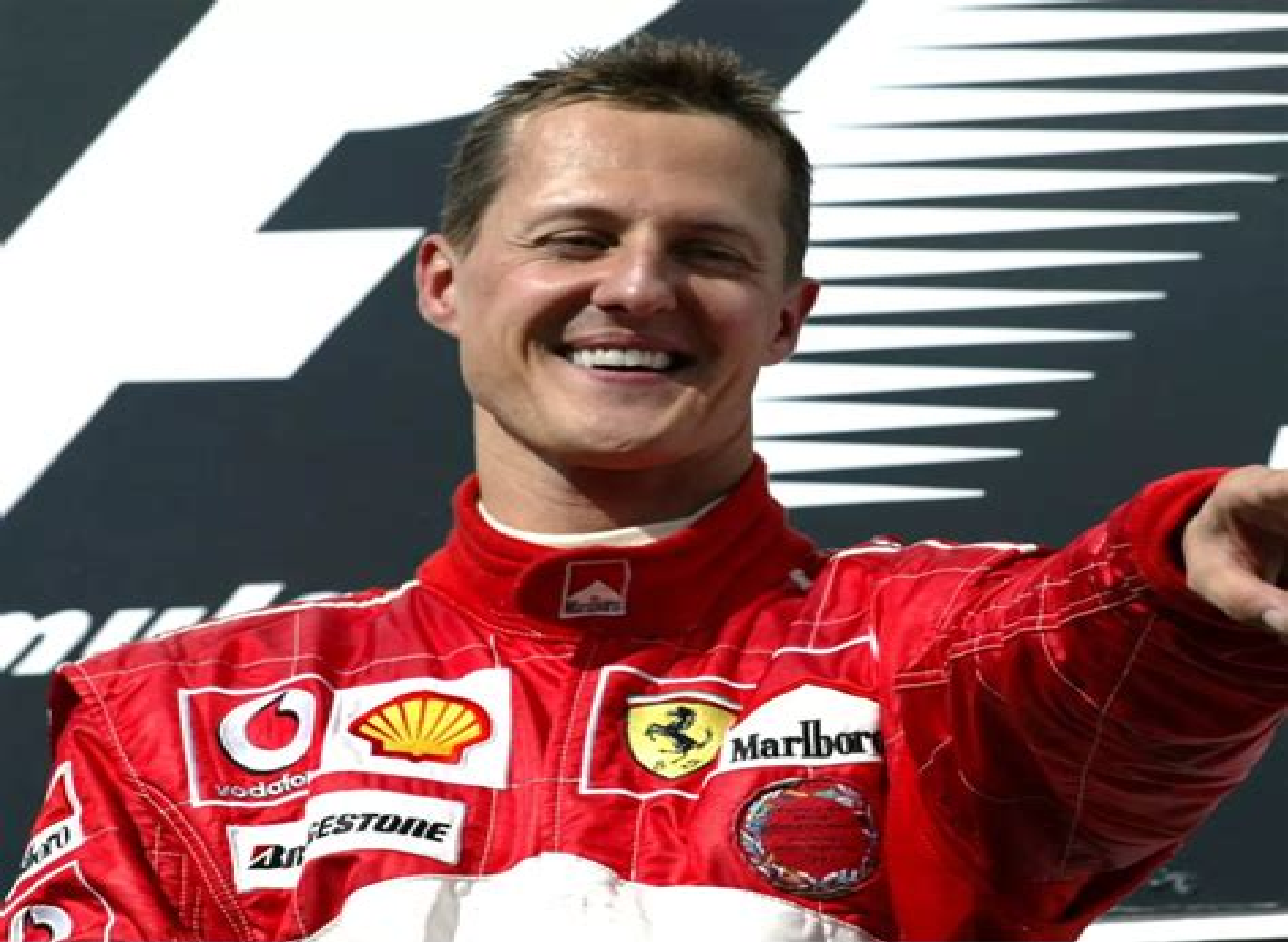
Motor Sport - Formula One - F1 - 2000 Hungarian Grand Prix - Budapest - Hungary - Race - 100004 Michael Schumacher - Ferrari celebrates winning the race Shutterfly