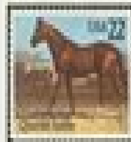
Quarter Horse — A1538

2184 A1537 22c gray green & pink red a Post marking (PM)