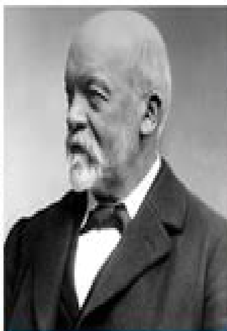
Gottlieb & Wilhelm Motorcycle