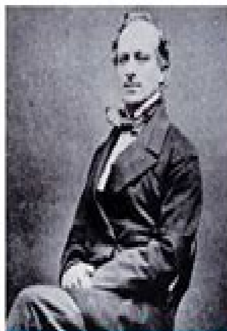
Francis Rynd Injection