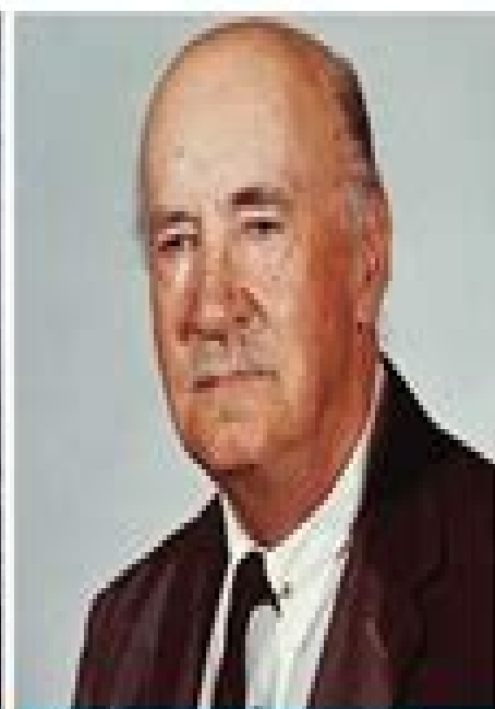
Igor Sikorsky Helicopter