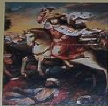
Warrior on Horseback, 1980, D. C. A. S. 1980