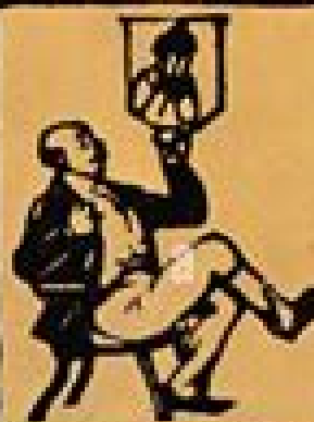
Proprietor of white Slaves