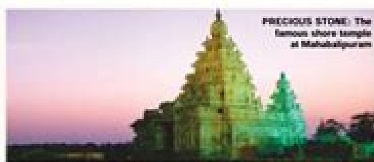
PRECIOUS STONE: The famous shore temple at Mahabalipuram.

Maritime commerce with southeast Asia flourished and ships docked at Mahabalipuram.