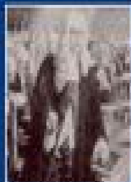
John Peter Zenger Trial (1735)