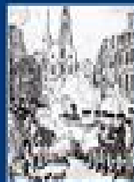
Boston Massacre Trials (1770)