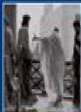
Trial of Jesus (30 C.E.)