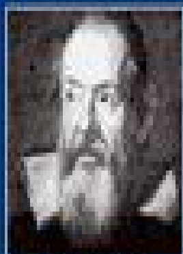
Trial of Galileo (1633)