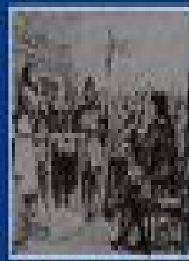
Salem Witchcraft Trials (1692)