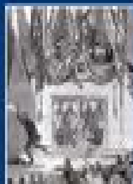
Lincoln Conspiracy Trial (1865)