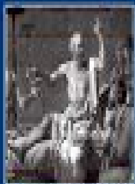
Trial of Socrates (399 B.C.E.)