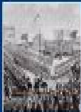
Dakota Conflict Trials (1862)