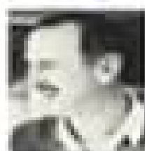
DAME GLENDA JACKSON