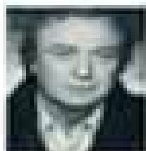
SIR IAN MCKELLEN

Shakespeare, Donne, Brooke, Pope, Wordsworth, Byron, Shelley, Keats, Yeats, Blake, Lear, Whitman, Tennyson, Dickinson & many others