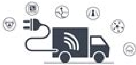
Conncted car technology