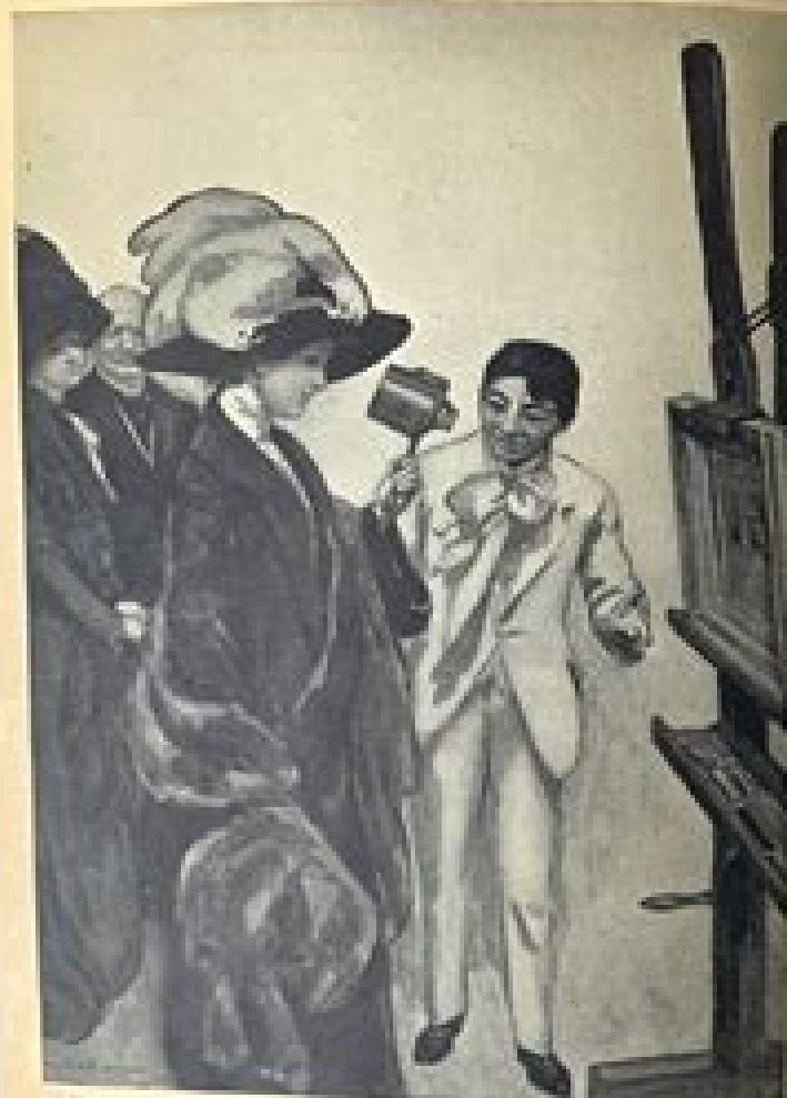
"THE DUCHESS OF MARCHES WAS CONDUCTED TO THE SCARLET ROOM AND STING CASINO AT THE PICTURE CALLED "THE HAUNTED PAGODA.""