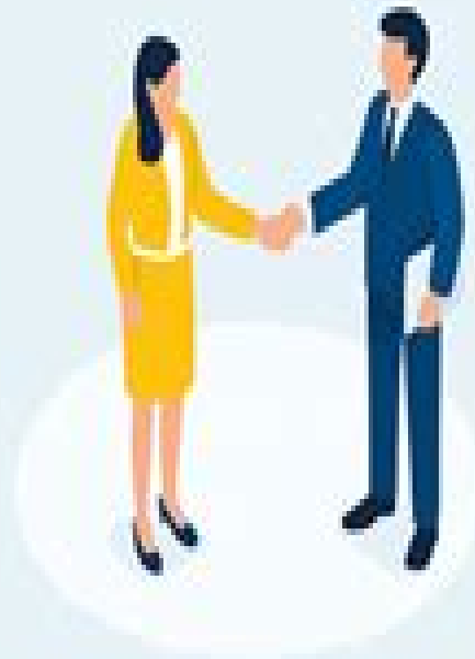
SUPPLIER SOURCING & NEGOTIATION