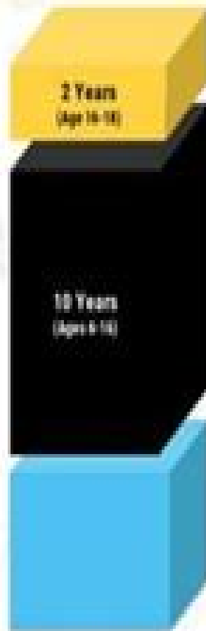
Existing Academic Structure