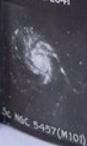
Se NDC 5457(M10)