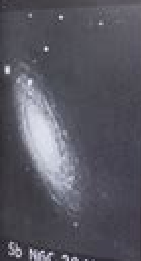
3b NAC 284