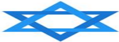
STAR OF DAVID