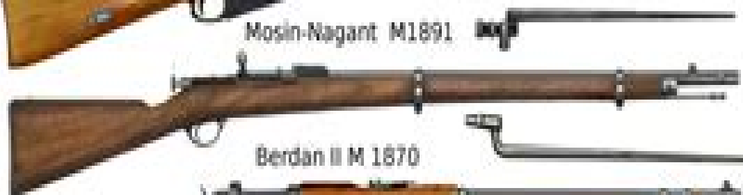
Berdan II M 1870