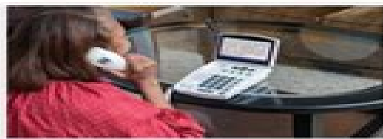
PA Captioned Telephone Relay Service, page 32