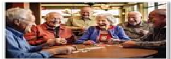
Housing Options, page 52