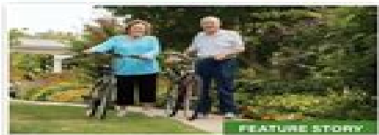
Dunwoody Village, page 24