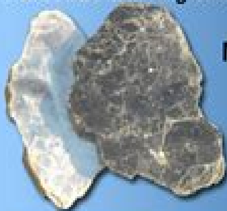
Muscovite and Biotite