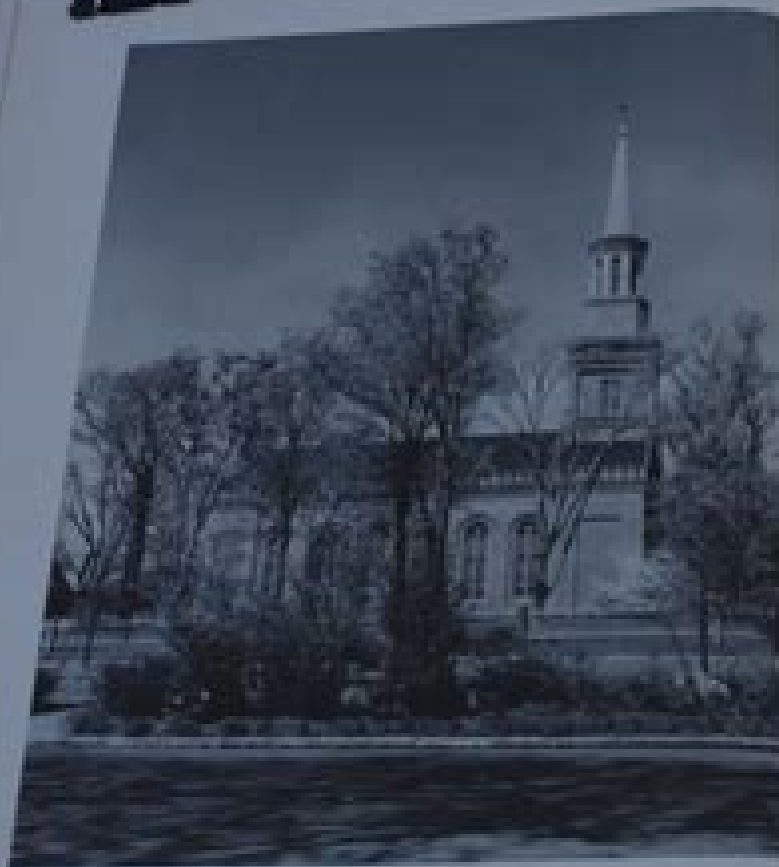
First Presbyterian Church, Augusta, Ga.