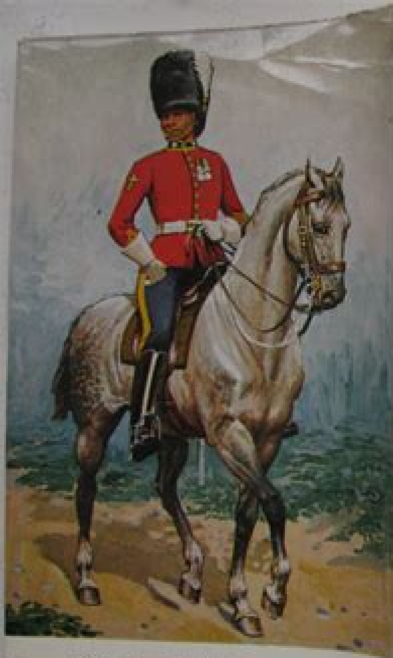
Regimental Scout, Royal Scots Greys, c.1900