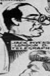
JACK BYERS - LONDON - TELEGRAPH