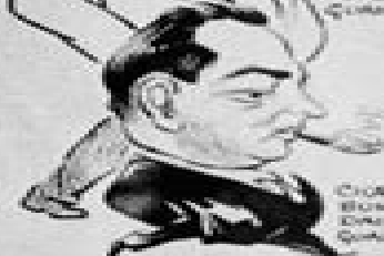
CLAYTON BURNS - DAILY COURIER