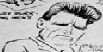
WILLIAM PETTIT - DAILY COURIER