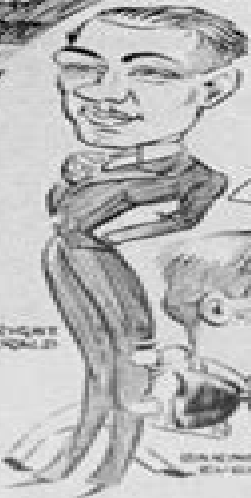
STANLEY PORTER - EVENING NEWS