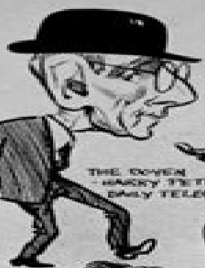
THE OWEN - HARRY PETERS - DAILY TELEGRAPH