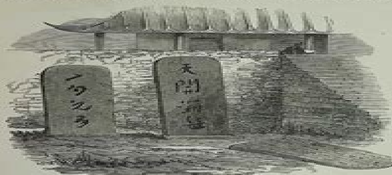
GATEWAY OF THE GREAT WALL OF CHINA.

There is a large number of towers, and the wall is very high. The wall was built by the Chinese, and the stones were of the same material. The wall was built by the Chinese, and the stones were of the same material. The wall was built by the Chinese, and the stones were of the same material.