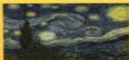
Vincent Van Gogh