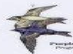
Purple Martin Progne subis 9"