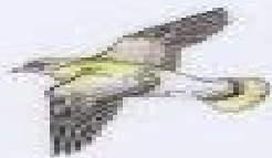
Band-tailed Pigeon Columba fasciata 12"