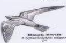
Black Swift Cypseloides niger 5"