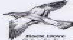
Rock Dove Columba livia 12"