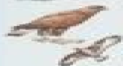
Red-tailed Hawk Sharp-shinned Hawk