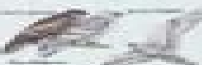
Broad-winged Hawk Northern Saw-whet Owl