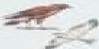
Red-shouldered Hawk Sharp-shinned Hawk