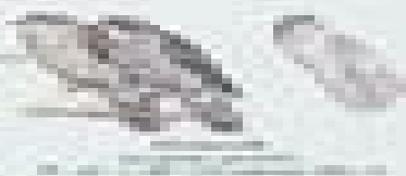
Broad-winged Hawk Northern Saw-whet Owl