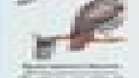
House Wren Chickadee