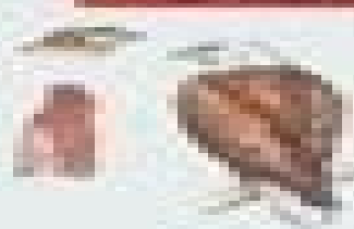
Cooper's Hawk Northern Saw-whet Owl