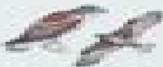
Broad-winged Hawk Northern Saw-whet Owl