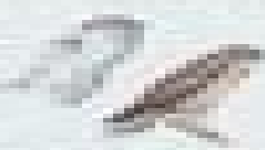
Red-shouldered Hawk Sharp-shinned Hawk