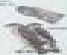
Common Nighthawk Screech Owl