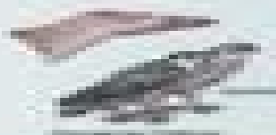
Common Nighthawk Screech Owl