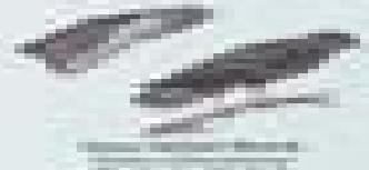
Common Nighthawk Screech Owl