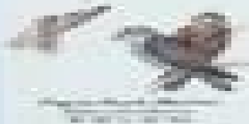
House Wren Chickadee