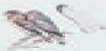
Broad-winged Hawk Northern Saw-whet Owl