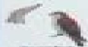
House Wren Chickadee