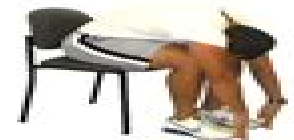
GLUTEAL & LOW BACK

• Hold each stretch for 15-30 sec • Stretch slowly • Stop if you feel pain