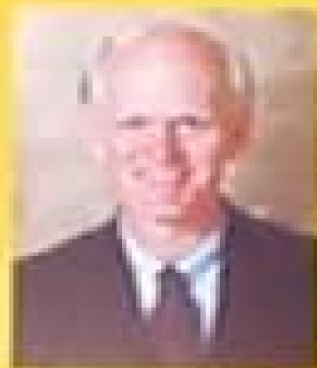
Marshall Goldsmith, CEO Coach

This is the first of a series of 5 courses on the coaching techniques of Marshall Goldsmith. It contains text, videos, and interactivity. This course describes the coaching, feedback, and feedforward process, shows typical behaviors of leaders that need to be changed, identifies challenges in helping people change.