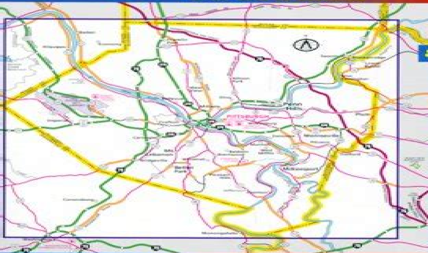
StreetFinder Coverage Area