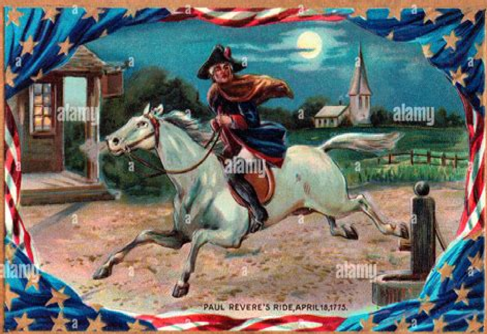
PAUL REVERE'S RIDE, APRIL 18, 1775.