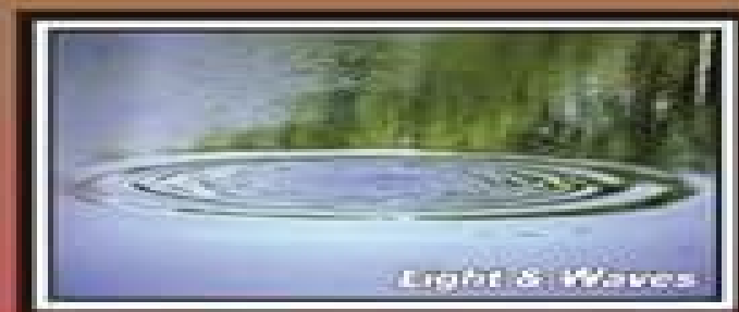
Light & Waves