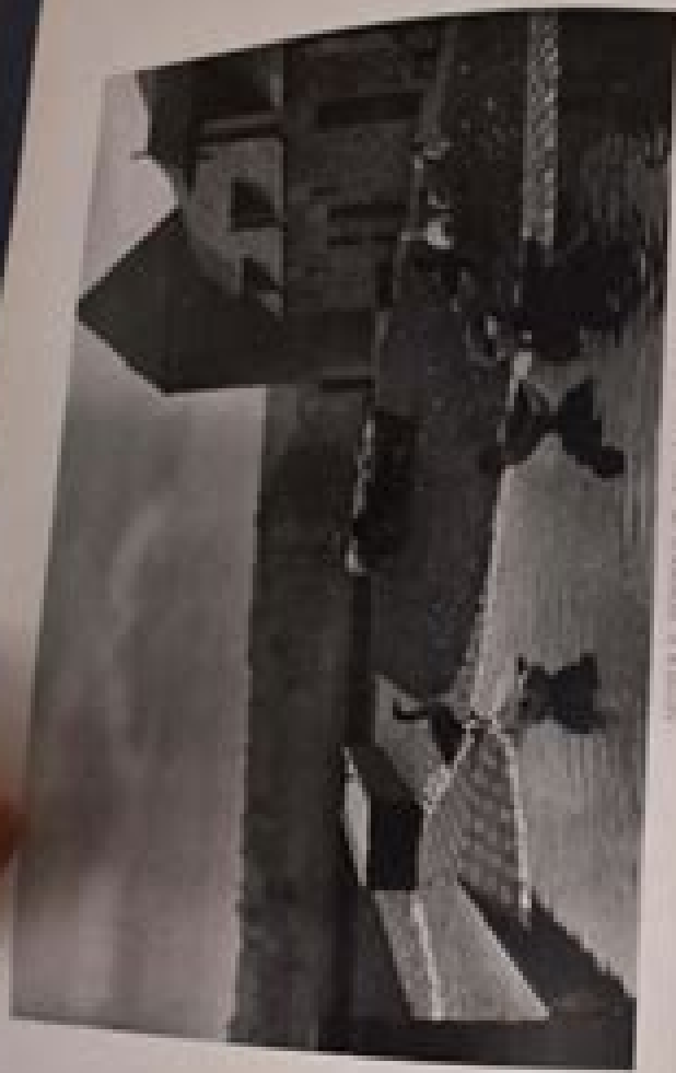
MELLOR MEIGS & HOWE 1923