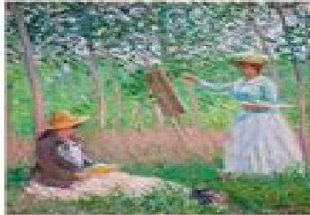
"In The Woods at Giverny, 1887" The Los Angeles County Museum of Art