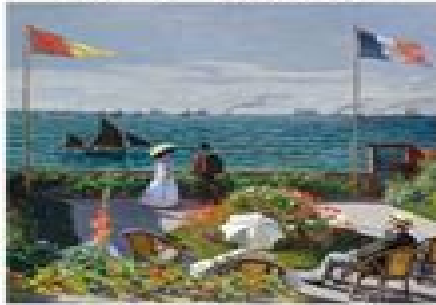
"Garden at Sainte, 1867" The MET Museum