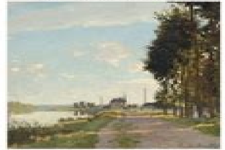
"Argenteuil, 1872" The National Gallery of Art