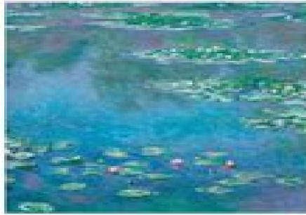
"Water Lilies, 1906" The Art Institute of Chicago