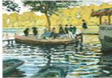
"La Grenouillère, 1869"