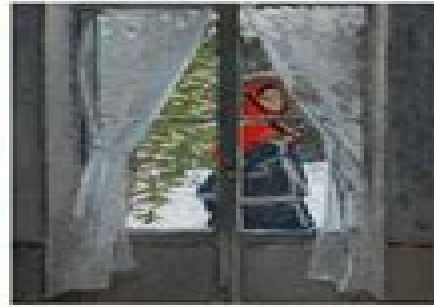
"The Red Kerchief, 1868 - 1873" The Cleveland Museum of Art