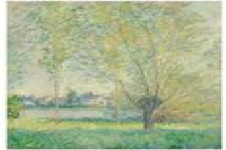
"The Willows, 1880" The National Gallery of Art