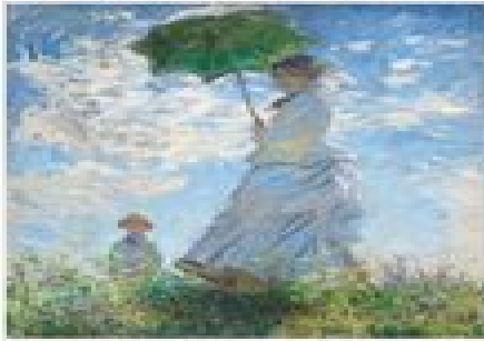
"Woman With a Parasol, 1875" The National Gallery of Art