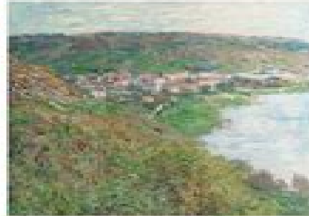
"View of Vetheuil, 1880" The Los Angeles County Museum of Art