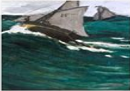
"The Green Wave, 1866 - 1867" The MET Museum