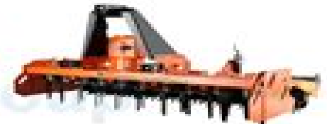
③ Rotary Tiller