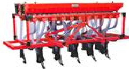
④ Seeds Sowing Machine