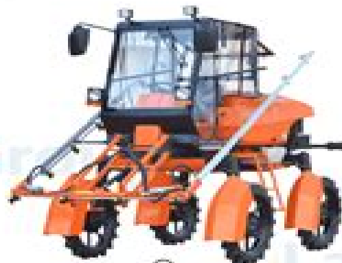
⑤ Pesticide Boom Sprayer