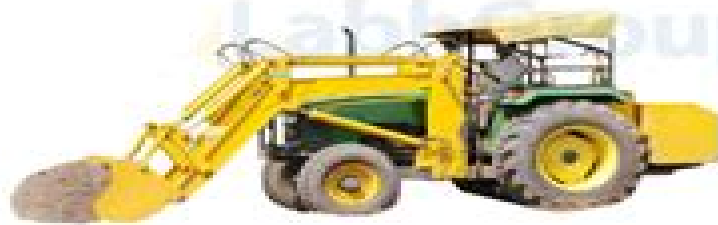
① Farm Land Preparation Machine