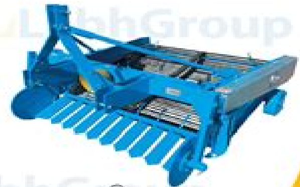
⑥ Potato Digger Machine