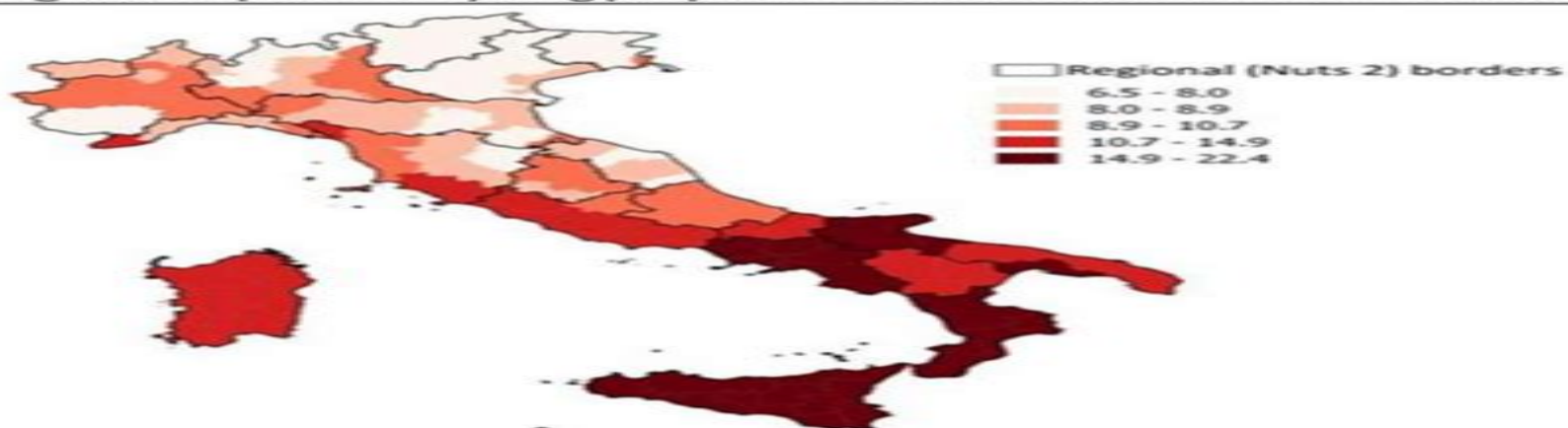
Fig. 4c. Proportion of households potentially suffering economic hardship (c)