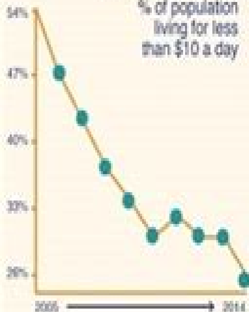
Low inequality with Gini Index at

% of population living for less than $10 a day