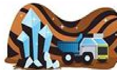
Precious Metals, Minerals, Roc