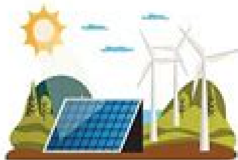
Wind Power and Solar Energy