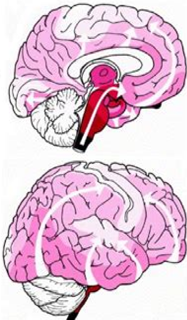
Atrophy Network (in vivo)