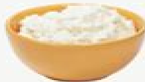
cottage cheese (65%)