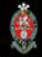
Princess of Wales's Royal Regiment