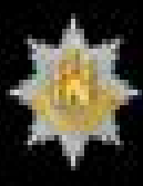
Royal Anglian Regiment