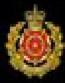
Duke of Lancaster's Regiment