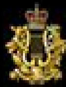
Corps of Army Music