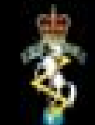
Royal Electrical & Mechanical Engineers