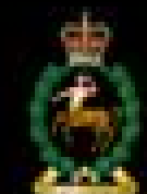
Royal Army Veterinary Corps