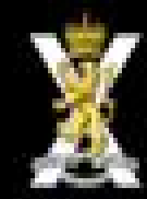
Royal Regiment of Scotland