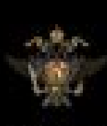
Queen's Dragoon Guards