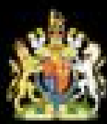
General Service Corps