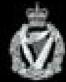
Royal Irish Regiment