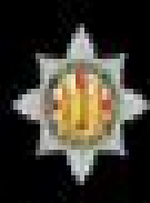
Royal Dragoon Guards