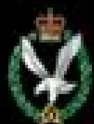
Army Air Corps