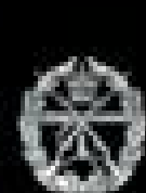
Small Arms School Corps