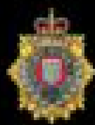
Royal Logistic Corps