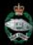
Royal Tank Regiment