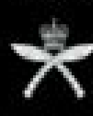
Royal Gurkha Rifles