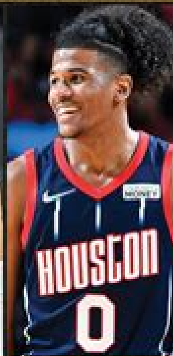
JALEN GREEN Houston Rockets