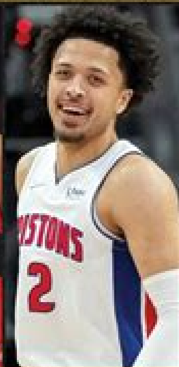
CADE CUNNINGHAM Detroit Pistons