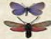
Common blue butterfly Six spot burnet moth