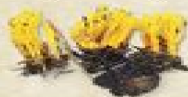
Stag's horn fungus