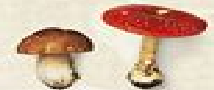
Penny bun mushroom and fly agaric