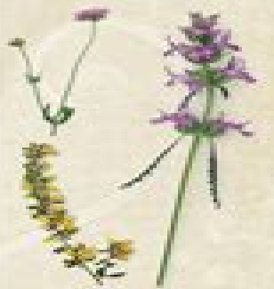
Field scabious, hairybroom, and wood betony