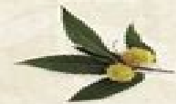
Sweet chestnut leaves and fruit