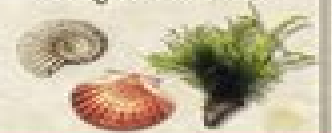
Ammonite fossil, scallop shell, and green seaweed