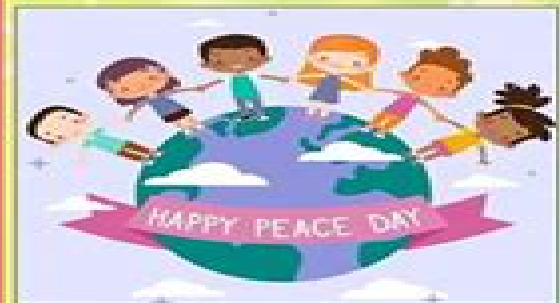
GLOBAL PEACE MONTH