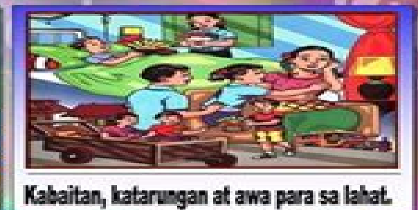
Kabaitan, katarungan at awa para sa lahat.