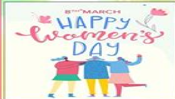
NATIONAL WOMAN'S DAY