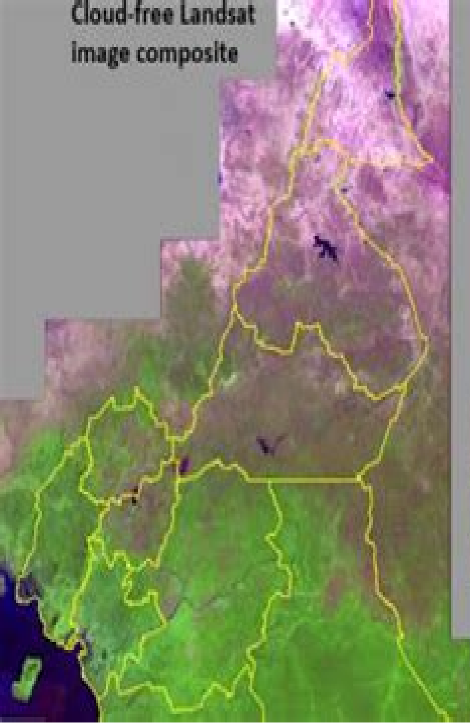
Stratified random sample for forest loss area estimation