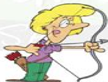
TIRO CON ARCO