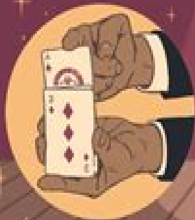
The Rising Card