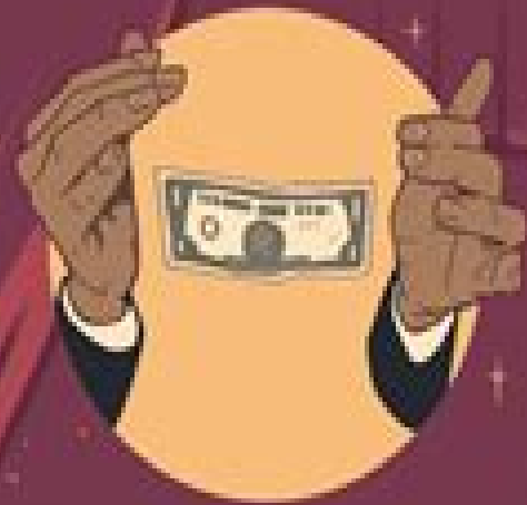
The Levitating Dollar