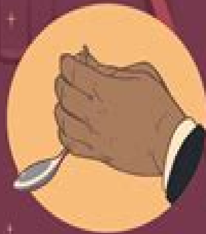
The Spoon Bend