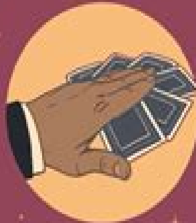
The Magnetic Hand