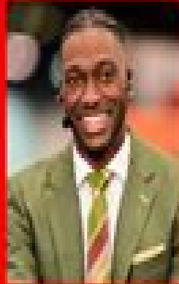
ROBERT GRIFFIN III ANALYST