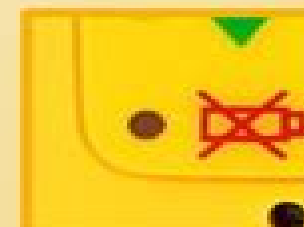
Indicateur de batterie avec LED rouge