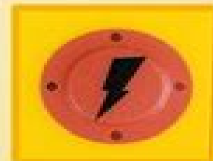
Interrupteur de choc