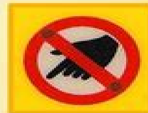
Ne pas toucher le patient