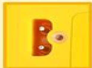
Connecteur des électrodes Prise

Le Mini AED Trainer XFT-D0009 est conçu pour former efficacement les intervenants d'urgence à l'utilisation d'un défibrillateur externe automatique.