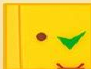
Indicateur d'état avec LED verte