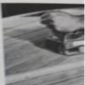
For finish-hand sanding, three-partitive feel sander of wood about 3 in. wide. It serves for

various constructions, with type, either old or new, to over-run the edges of a stock. On new work, it is to be quite thin, usually may have already been haven't much of the work steps. On older work, thicker, but as a rule, thoroughly when prep.