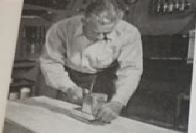
Pad sanders are of two types, orbital and straight-line, and are used mainly for the finish steps with the finer grades of sandpaper.