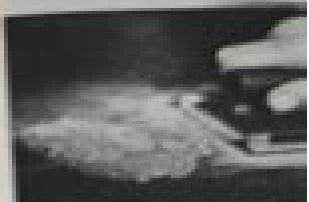
Sustaining use of "shoeshine" sanding block forms edges that cut in at a self-sustaining, rounded shape.

Should the project you are working on be