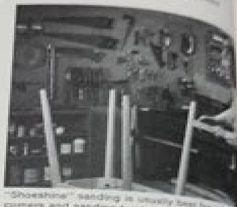
"Shoeshine" sanding is usually best for rounding corners and sanding turnings. Shaded marks show desired radius and leaves smooth surface.

To sand and grain by hand, clamp sandpaper to work as pictured. This not only keeps the grain flat but prevents rounding edges. 50, use an orbital block.