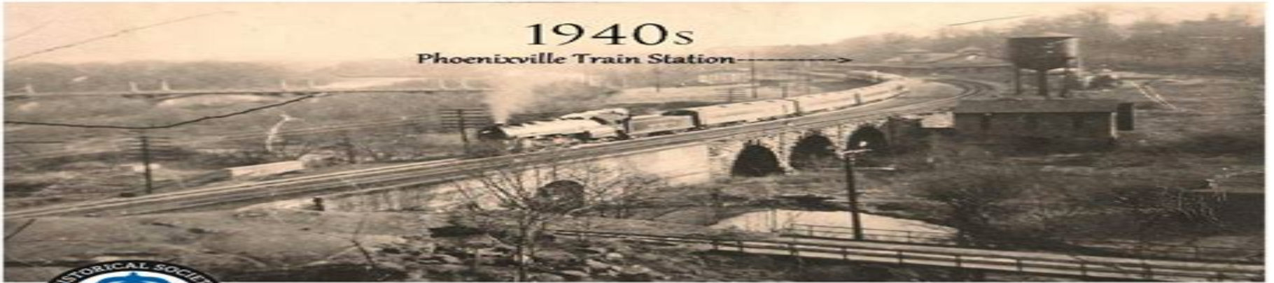
1940s Phoenixville Train Station