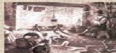
Early colonial life was sometimes harsh especially on rural farms