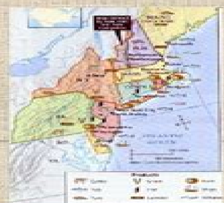
Northern Colonies had economies that were much more diverse. Agriculture, fishing, and trading were all important activities.